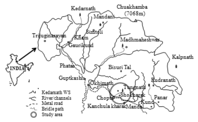
Figure 1 - Location of the study area in Kedarnath Wildlife Sanctuary.

was selected due to its suitable altitudinal range (2900-3680 m a.s.l.), variety of micro-habitat types and accessibility throughout the year.